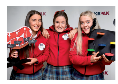
Students from Ard Scoil Rath Iomghain, Rathangan, Co. Kildare