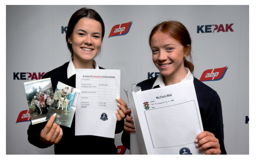
CARRICK ON SHANNON COMMUNITY SCHOOOL, CARRICK ON SHANNON, CO. LEITRIM