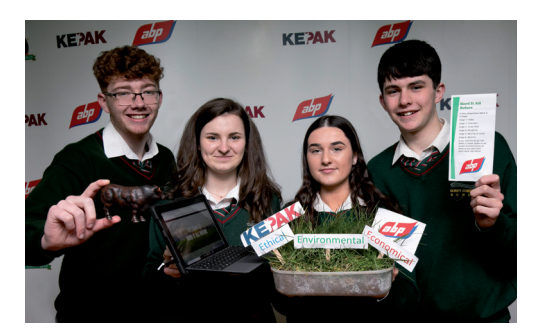
GOREY COMMUNITY SCHOOL, GOREY, CO. WEXFORD