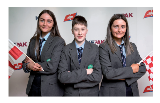
BOHERBUE COMPREHENSIVE SCHOOL, BOHERBUE, CO. CORK