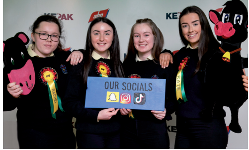
MERCY SECONDARY SCHOOL, BALLYMAHON, CO. LONGFORD